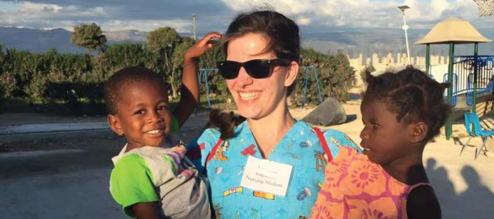
Nurses and nursing students are vital partners in FFP's medical outreach. Pictured here, a member of the Sigma Theta Tau nursing team spends special time bonding with children at the CAD children's home in Ganthier, Haiti.