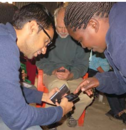
In Kenya, FFP worked with internet.org to provide free cell phone access to the internet.