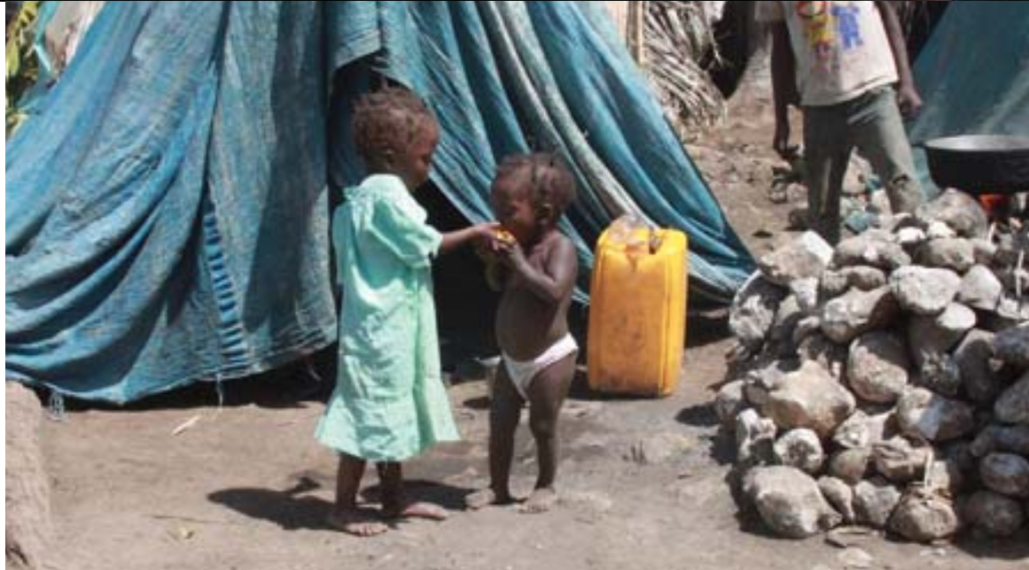
Haitians affected by the deportation crisis in the Dominican Republic flooded border towns in Haiti. FFP teams traveled to these areas to bring clean water, food, relief kits and medical care to men, women and children. Above: Children outside their "home" in Fond Jeannette, Haiti.